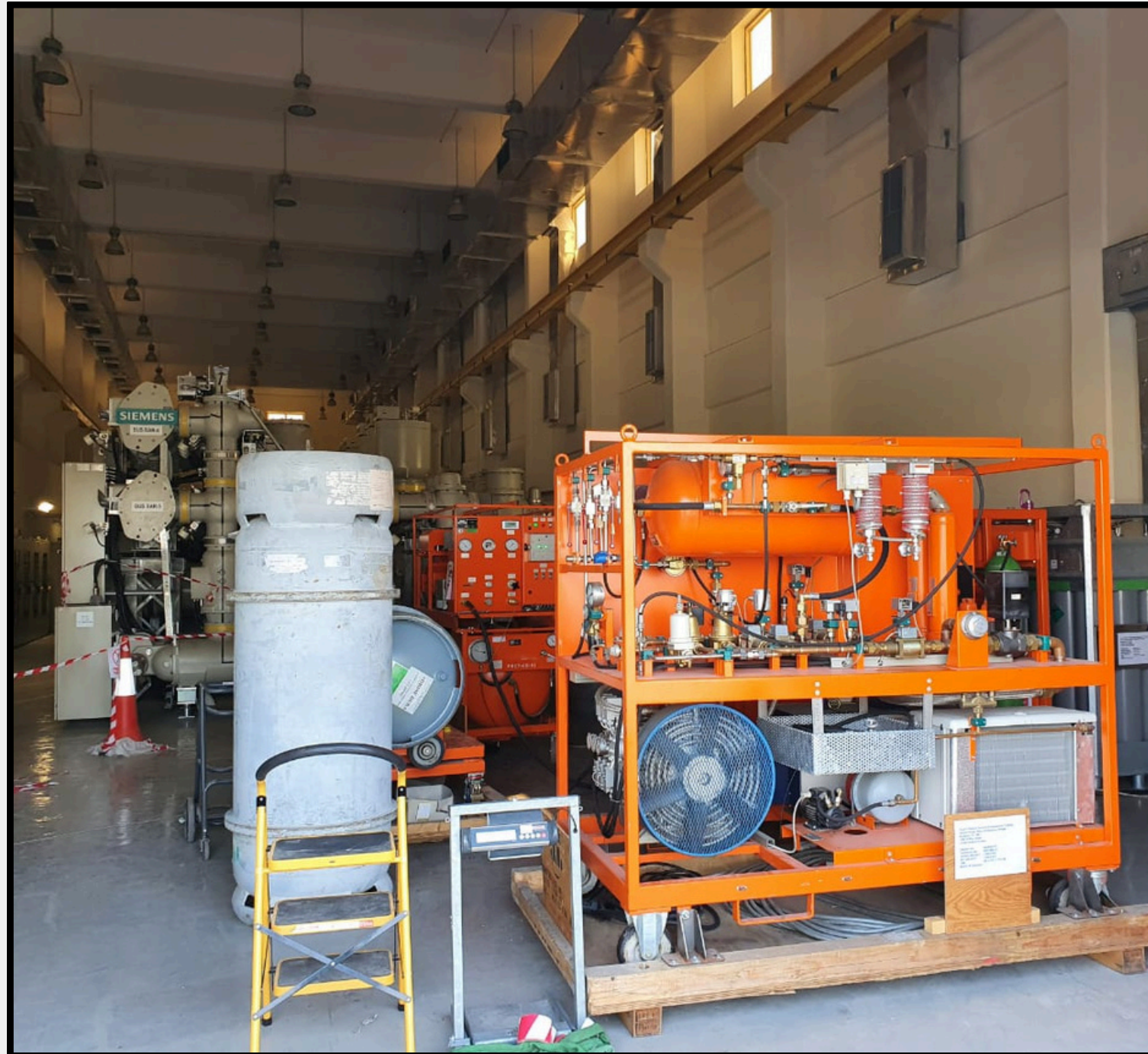
SF 6 Gas re-conditioning at Middle East